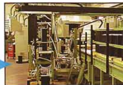
Automated Cell Assembly Line